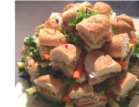
Sub-Total ↑ Box Lunch ↓