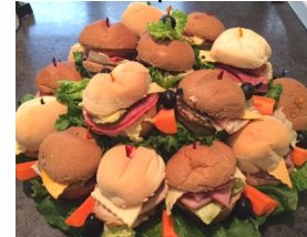
Elegant Standard ↓